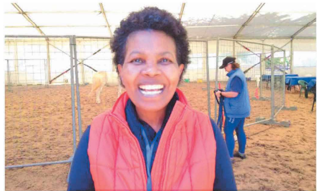
Image: Happiness and Tear after a phenomenal Join UP Experience "Oh what a day. God made everything for a purpose. Truly astonished and humbled".

SARDA invites you all to be part of our 50th Anniversary celebrations, and we look forward to your continued interest and support, in our consistent drive to achieve Equity, Inclusion and Diversity in Society. Please reach out to us and Join UP to live your dream.