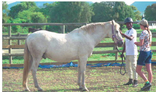
Image: The join up moment