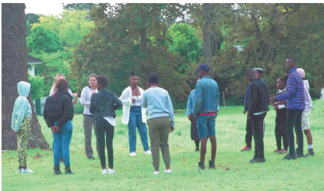
Image: Participants learning about breathing techniques and the use of the emotional thermometer.

As part of the introduction to emotional intelligence, the participants received training on the use of the "emotional thermometer"; a tool to identify, measure and self-regulate their emotions, as well as diverse breathing techniques that could help them settle in their bodies to recognize, and process emotions. Their first meeting with the horses was extremely successful since many of the participants were initially wary and scared of them, but little by little they gained confidence to approach them and by the end of the session, they were all comfortable around the horses.