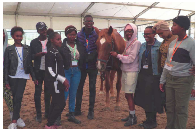
Image: The Lead Up team and participants