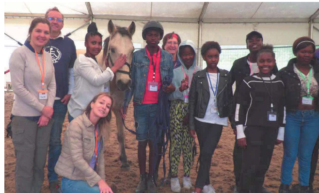
Image: The Lead Up team and participants